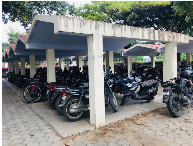
Ratio of Parking Area to Total Campus Area in KITS