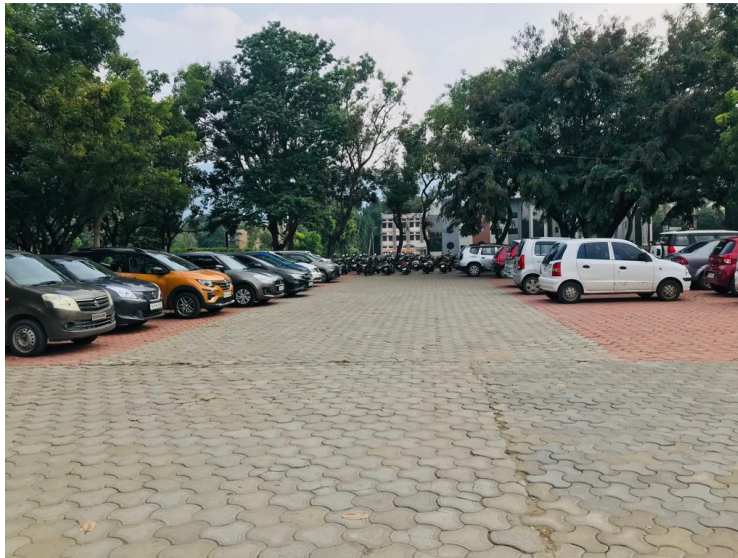
Example of Ratio of Parking Area to Total Campus Area in KITS